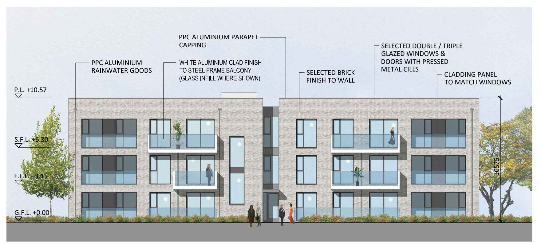
Front Elevation (Street Elevation) scale 1:200