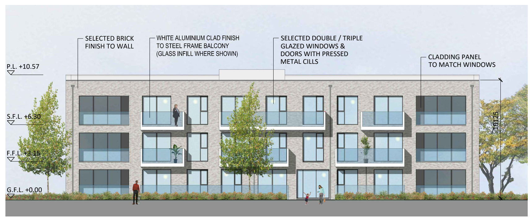
Rear Elevation (Elevation to Parkland) scale 1:200